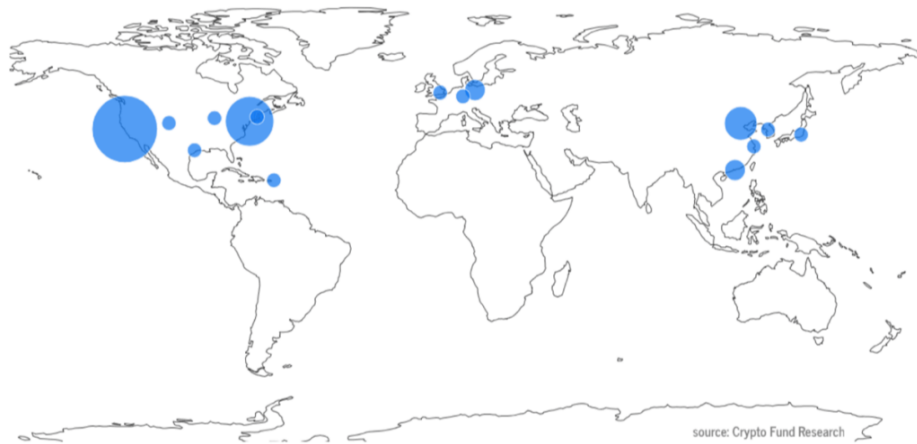
Top 50 Blockchain VCs by Location

35 of the 50 leading venture capital firms investing in blockchain and crypto are based in the United States. Eight are based in Hong Kong/China and three in Germany.